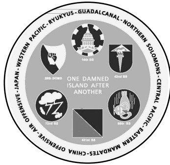
11th BGA Challenge Coin (front)

Please list extra islands and number of nights you are interested in and we will call you to discuss.