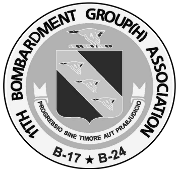
11th BGA Challenge Coin (back)